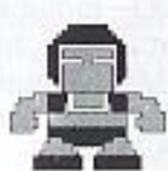
WARS MAN Bear Claws